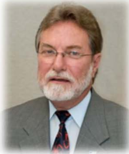
William D. Bestpich Council