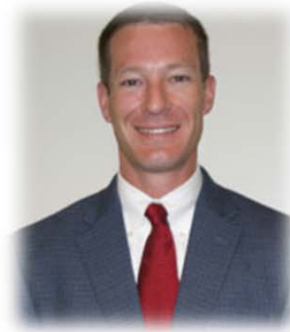
Court G. Rosen Council